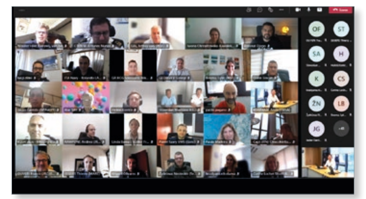
CISE aims to make European and national maritime surveillance systems interoperable, enabling secure information exchange

The recently adopted European Maritime, Fisheries and Aquaculture Fund (EMFAF) brings in new funding opportunities to support member states in the implementation of the Common Information Sharing Environment (CISE). During the workshop, various experts from the European Commission (DG MARE) and EMSA explained how member states can use the EMFAF fund to co-finance their CISE-related activities by including them in their EMFAF National Operational Programme to be submitted to the European Commission. Another option, presented by CINEA (the European Climate, Infrastructure and Environment Executive Agency), is to participate in the new Call for proposals "Action for a CISE incident alerting system". This was launched on 26 August and aims to enhance the cooperation between public maritime authorities by promoting the development of at least two services at pre-operational phase and to foster the uptake of CISE in view of its operationalisation.